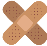
MINOR CUT OR BURN