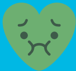
DIARRHEA OR VOMITING