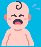
FUSSINESS OR COLIC