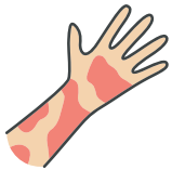
MINOR RASH OR INFECTION