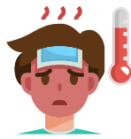
SORE THROAT, FEVER OR COLD SYMPTOMS