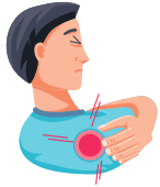
MUSCLE STRAIN OR SPRAIN